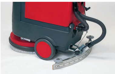
Suction nozzle curved