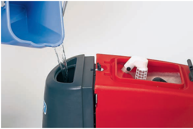
Large filling hole