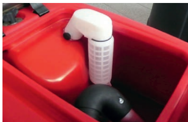
Efficient motor protection thanks to float system