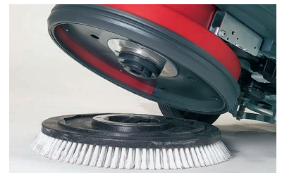
Easy brush assembly