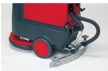
Suction nozzle curved