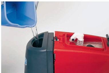
Large filling hole