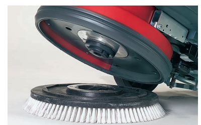
Easy brush assembly